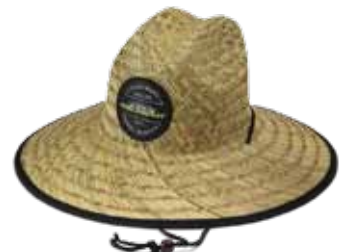
STRAW HAT $20. 95