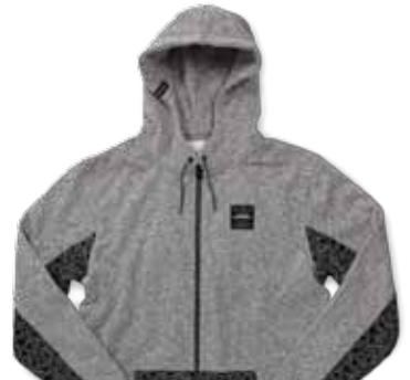
STATIC ZIP $59. 95