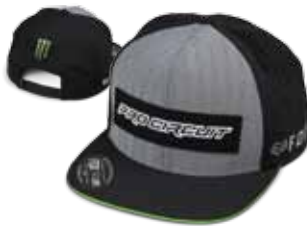
TECH SNAPBACK $29. 95