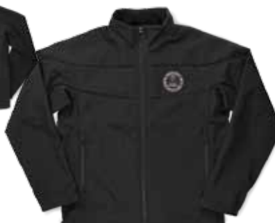
PATCH SOFTSHELL $84. 95