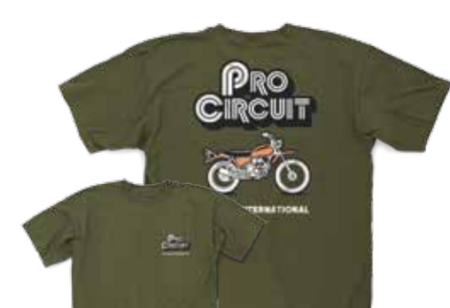
PIT BIKE TEE PLEASE CALL