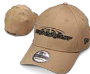
CLASSIC CAP $27. 95