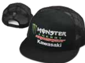
TEAM SNAPBACK MESH AND STANDARD $28. 95 (EACH)