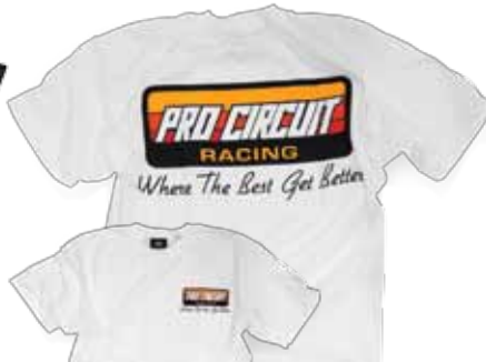
ORIGINAL LOGO TEE