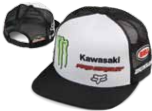
EGLIN SNAPBACK $29. 95