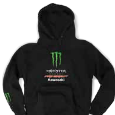
TEAM HOODY $49. 95