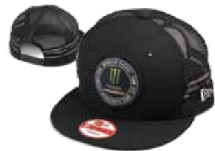
PATCH SNAPBACK $34. 95