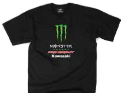
TEAM TEE $24. 95