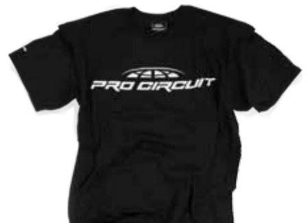
SIMPLE ONE TEE