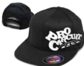
DAREDEVIL HAT PLEASE CALL