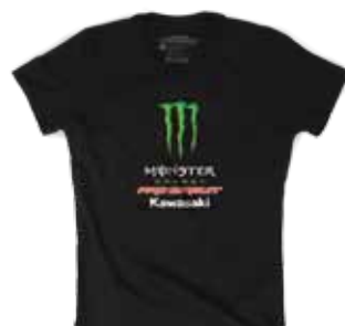
TEAM WOMEN TEE $21. 95