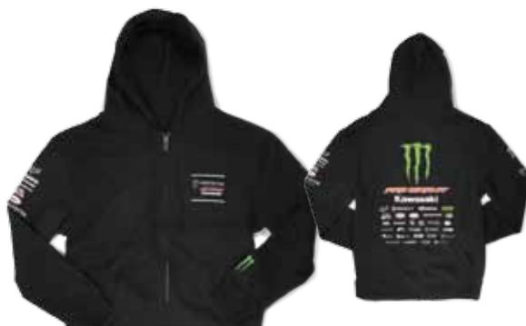
TEAM FULL LOGO ZIP $49. 95