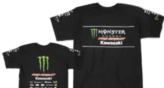
TEAM FULL LOGO TEE $24. 95