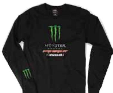
TEAM LONG SLEEVE TEE $24. 95