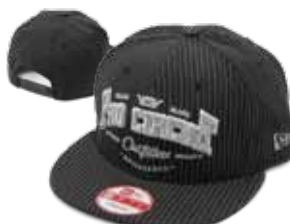
OUTFITTERS HAT $29. 95