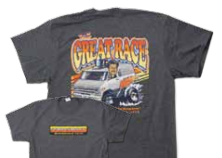
THE GREAT RACE TEE