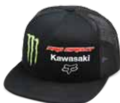
2020 TEAM SNAPBACK $28. 95