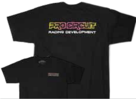
RACING DEVELOPMENT TEE

Lastly, our Monster Energy/Pro Circuit/Kawasaki line of apparel is as close as one can get to looking like part of the crew on race day. From our simple 3-logo design to our full logo designs, go all out with our styles ranging from tees, hoodies, hats and jackets in all the common sizes.