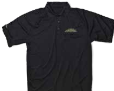
PRO CIRCUIT POLO PLEASE CALL