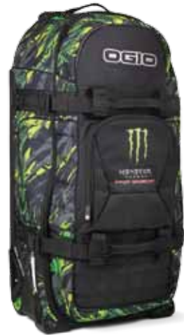
CRUISE GEAR BAG