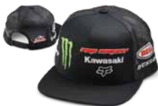
PODIUM SNAPBACK $37. 95