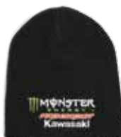
TEAM BEANIE $24. 95