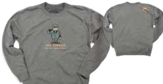
SERVICE CREW NECK PLEASE CALL