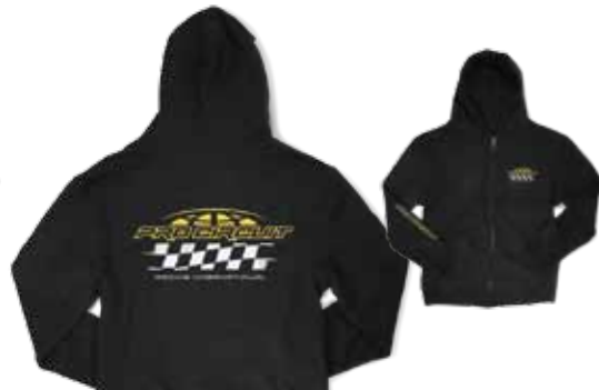
RACER ZIP PLEASE CALL