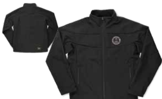
PATCH SOFTSHELL $84.95