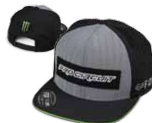
TECH SNAPBACK $29.95