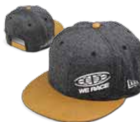
TREADMARK SNAPBACK $29.00