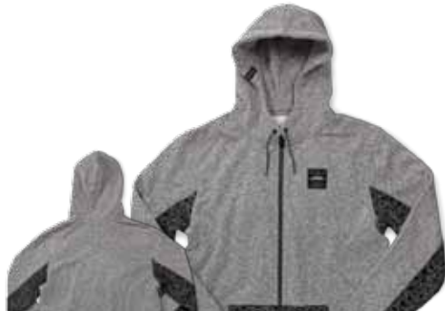
STATIC ZIP $59.95