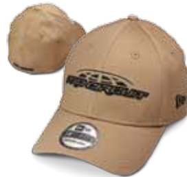
CLASSIC CAP $27.95