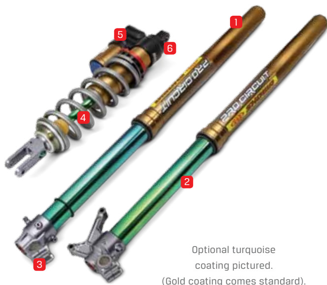
Optional turquoise coating pictured. (Gold coating comes standard).

Riders should also keep in mind our suspension accessories to go along with your newly freshened up set of suspension. We have triple clamps and linkage arms to greatly increase the handling of one's bike and most of these parts are simple bolt-on items.