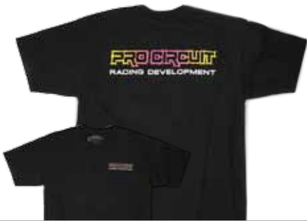
RACING DEVELOPMENT TEE $26.95

Finally, our Monster Energy/Pro Circuit/Kawasaki line of apparel puts you as close to being a team member as a fan can be. We offer a simple 3-logo team design or a much more decorated full logo design that includes all of our team sponsors. Race team apparel is available in multiple styles including tees, long sleeves, hoodies, hats and jackets in all the popular sizes.