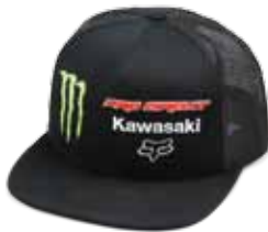
2021 TEAM SNAPBACK $28.95