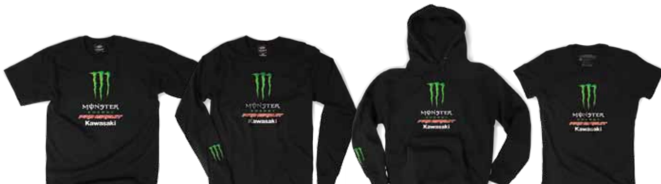
TEAM TEE $24.95