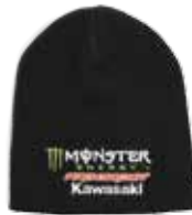
TEAM BEANIE $28.50