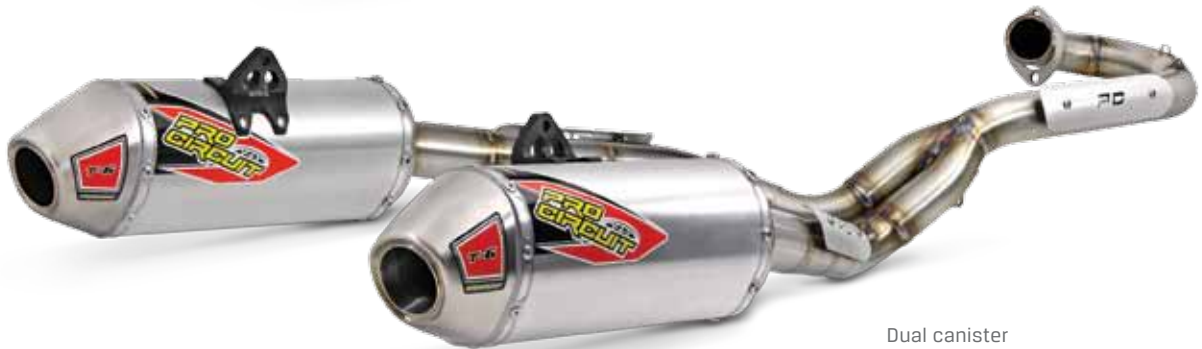
Dual canister exhaust system.