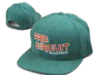
RETRO SNAPBACK $36.00