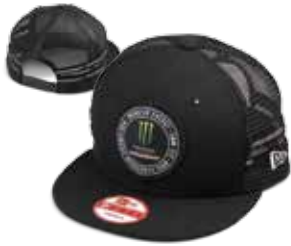
PATCH SNAPBACK $34.95