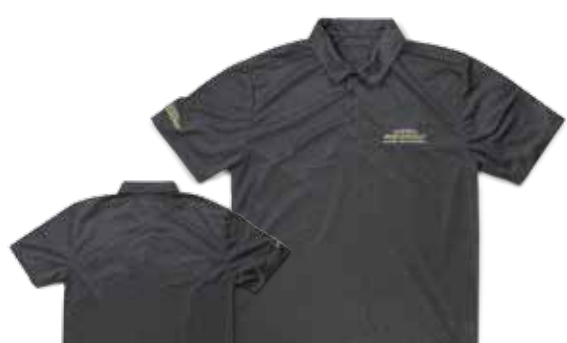
PRO CIRCUIT POLO FROM $45.00