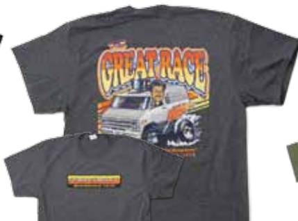
THE GREAT RACE TEE $21.00