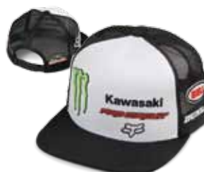
EGLIN SNAPBACK $29.95