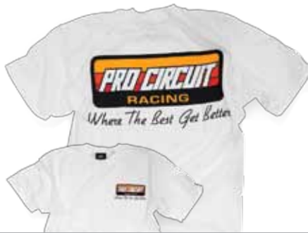
ORIGINAL LOGO TEE $21.95