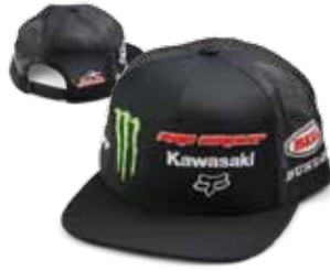
PODIUM SNAPBACK $37.95