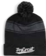
CHARCOAL BEANIE $26.50