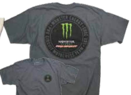
PATCH TEE $24.95