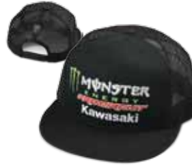
TEAM SNAPBACK MESH & STANDARD $28.95 (EACH)