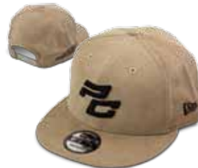
JAVA SNAPBACK $26.50