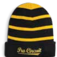
STINGER BEANIE $26.50