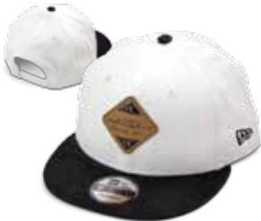
DIAMOND SNAPBACK $26.50