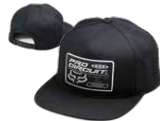
PRO CIRCUIT/FOX SNAPBACK $29.95