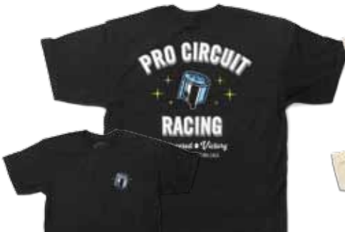
PISTON TEE $24.00