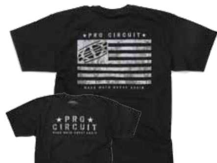
FLAG TEE $22.95