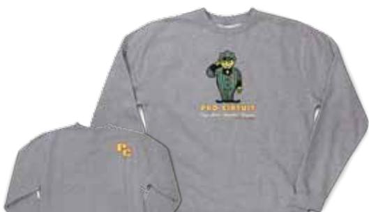
SERVICE CREW NECK $44.00