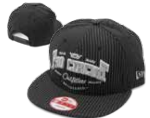
OUTFITTERS SNAPBACK $29.95