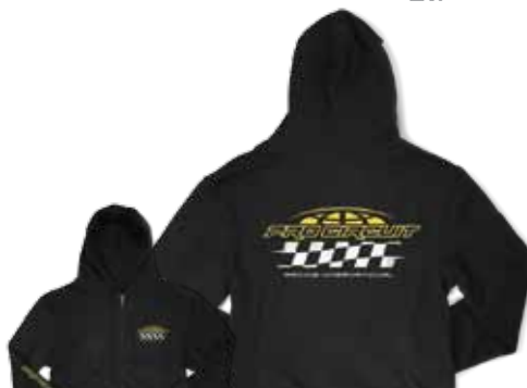
RACER ZIP $52.50