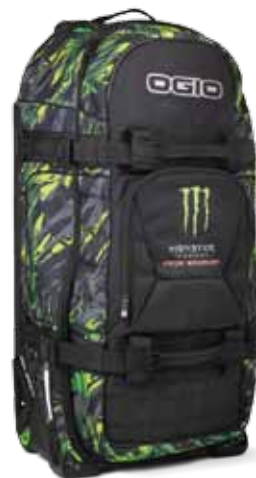
CRUISE GEAR BAG