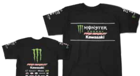
2021 TEAM FULL LOGO TEE $24.95