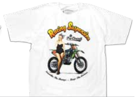
LADY TEE $26.95