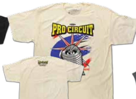
SPARK PLUG TEE $24.00