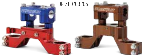
KLX110 '02-'20 DR-Z110 '03-'05