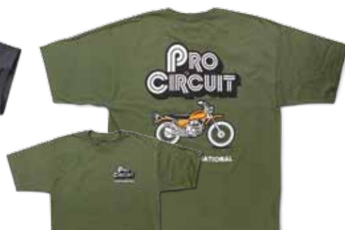
PIT BIKE TEE $21.00