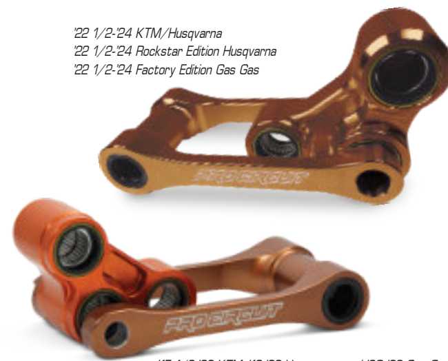
'22 1/2-'24 KTM/Husqvarna '22 1/2-'24 Rockstar Edition Husqvarna '22 1/2-'24 Factory Edition Gas Gas

Triple Clamp Kits include a clear anodized top and bottom clamp with a black reversible bar mount that fits 1 1/8" handlebars.