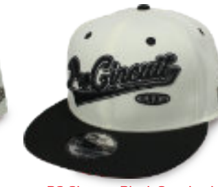
PC Chrome Black Snapback