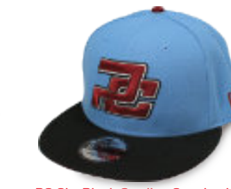
PC Sky Black Cardina Snapback