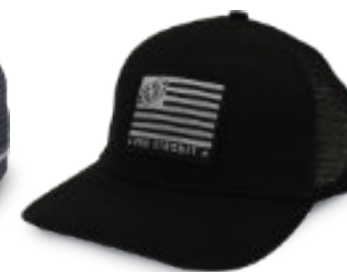
Flag Snapback (black)