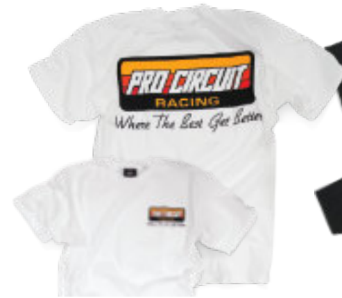
Original Logo Tee