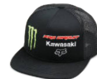
2024 Team Snapback