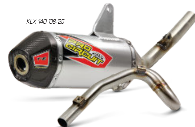
KLX 140 '08-'25

Our T-6 exhaust systems for mini moto bikes offer improved performance, durability, and a professional look. The mini moto T-6 system contains a stainless steel head pipe, brushed aluminum canister, and a carbon fiber end-cap. The T-6 system also comes equipped with a removable United States Forest Service approved spark arrestor, making it easy to alternate between off-road and closed-course racing. Available for select CRF, KLX, and TT-R models.