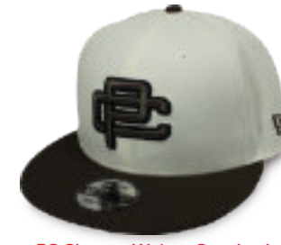
PC Chrome Walnut Snapback