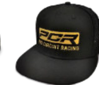
PC Racing Snapback