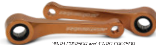
'18-'21 CRF250R and '17-'20 CRF450R

The stock linkage systems for the KTM and Husqvarna models causes the bike to have a feeling that is much too harsh and stagnant, whereas some of the preceding models had an OEM linkage system providing an unwanted lazy and soft feeling. The Pro Circuit linkage system utilizes some of the mechanical advantages of both designs, which allows for the use of a more true-to-weight spring rate and to reach the ultimate sweet spot in handling.