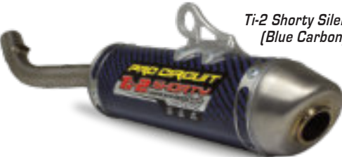
Ti-2 Shorty Silencer (Blue Carbon)

The R-304 was developed as a full-race two-stroke silencer. The compact design of the short aluminum canister offers optimum performance gains. Allen head screws ensure easy repacking when needed for extended product life.