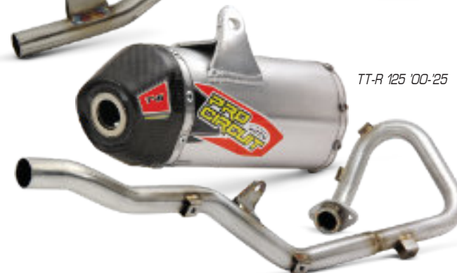
TT-R 125 '00-'25