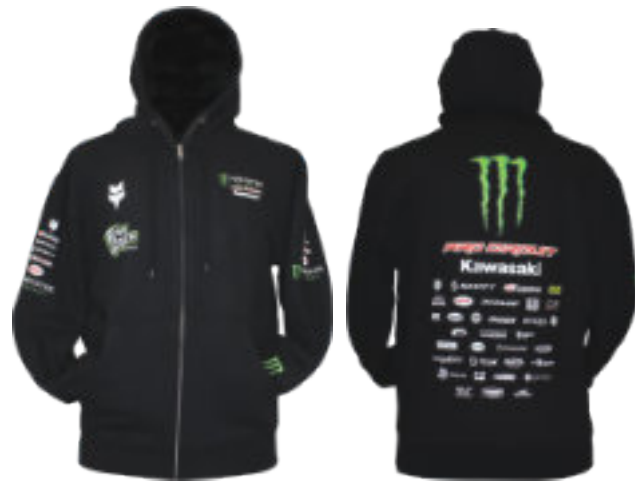
Team Zip Hoodie (front and back)