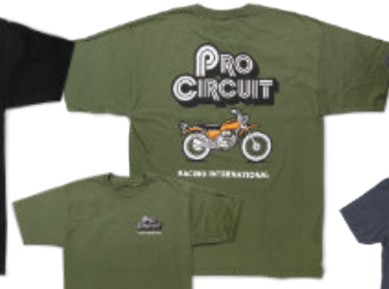
Pit Bike Tee