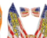
Stars and Stripes

All four-stroke exhaust is designed for closed-course competition only.