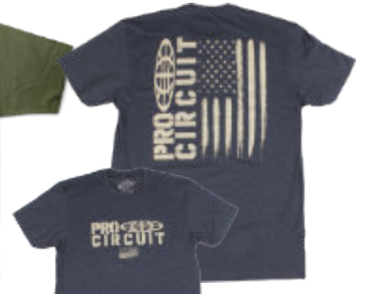
Logo Flag Tee