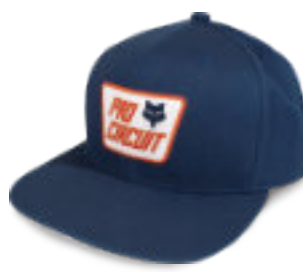
SS Prem Navy Snapback