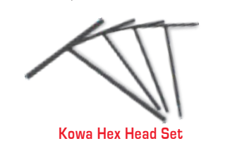
8mm T-handle short optional

Four-piece set includes 4, 5, 6, and 8mm hex head T-handles.