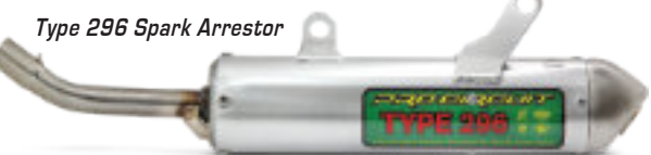
Type 296 Spark Arrestor

The 304's slightly longer body offers added top-end performance while reducing noise output. The brushed aluminum body and stainless steel inlet tube and end-cap gives you a silencer that looks as good as it performs.