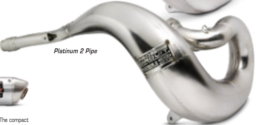
Platinum 2 Pipe

The Platinum 2 Pipe offers incredible performance with substantial power gains in the low-to-mid range but is tuned specifically for people who ride or race off-road. The Platinum 2 is also stamped from AKDQ high-quality carbon steel, consists of hand-welded and pounded seams, and features reinforced mounting brackets and stinger.