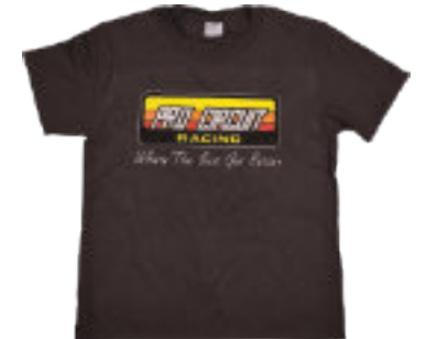
Original Stripes Tee (Youth sizes x-small to large)