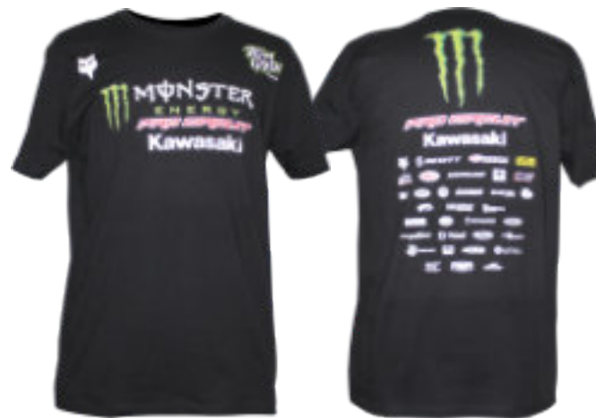
Team Full Logo Tee (front and back)