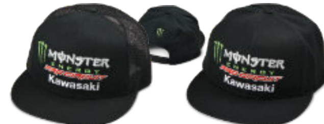
Team Snapback Mesh