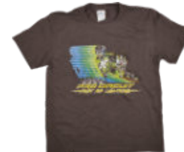
Moto Hero Tee (Youth sizes x-small to large)