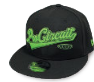
PC Black Neon Green Snapback