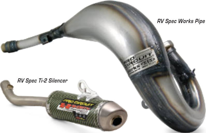
RV Spec Works Pipe

Available only for the 2002-2021 YZ125, the Ryan Villopoto Spec Ti-2 silencer was fitted for the multi-time champion but can now be bolted onto your bike. Offering a professional look and factory sound, the RV Ti-2 version increases power on the bottom end when compared to a stock YZ125 silencer.