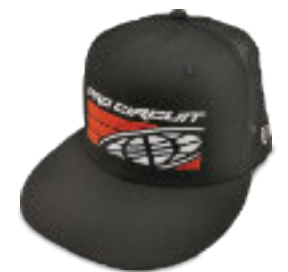
PC Globe Snapback