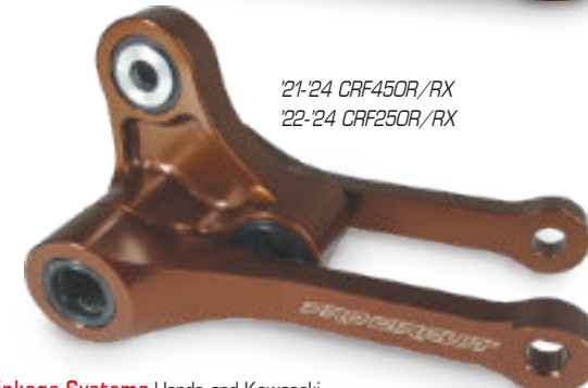
'21-'24 CRF450R/RX '22-'24 CRF250R/RX