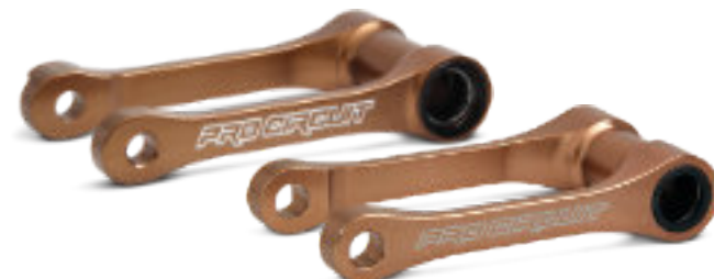
'11-'14 KTM 250/350/450SX and '12-'14 125/150/250 SX

The problem with the OEM preload collar for the '19-'24 KX450, '17-'24 RM-Z450, select '21-'22 Gas Gas and '16-'22 KTM and Husqvarna models is its plastic composition. During use, it heats up and along with dirt working its way underneath becomes deformed, which makes tuning and adjustment extremely difficult. Pro Circuit's solution offers a CNC-machined 6061 aluminum preload collar with a zinc-plated steel lock ring for improved durability and much easier adjustments. Discard your OEM preload collar for Pro Circuit's new preload collars.