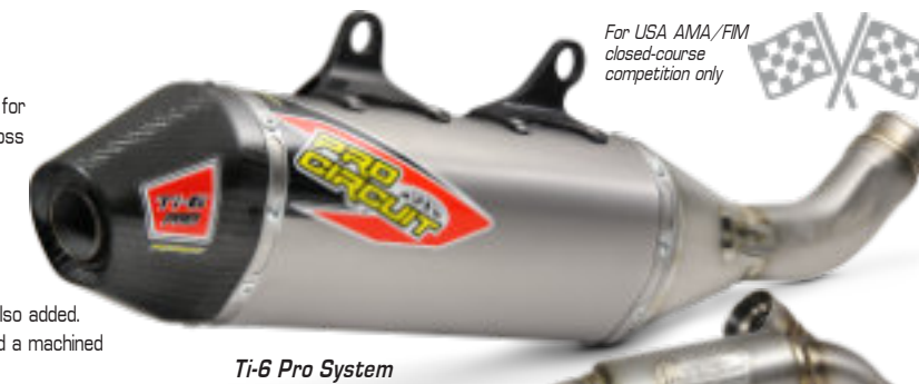
Ti-6 Pro System