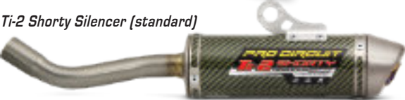
Ti-2 Shorty Silencer (standard)

The Ti-2 is similar to the popular R-304 silencer except its constructed with a carbon Kevlar shell, titanium tubing and titanium end-cap. The titanium and carbon Kevlar construction offers the "factory" look and appearance, while reducing weight.