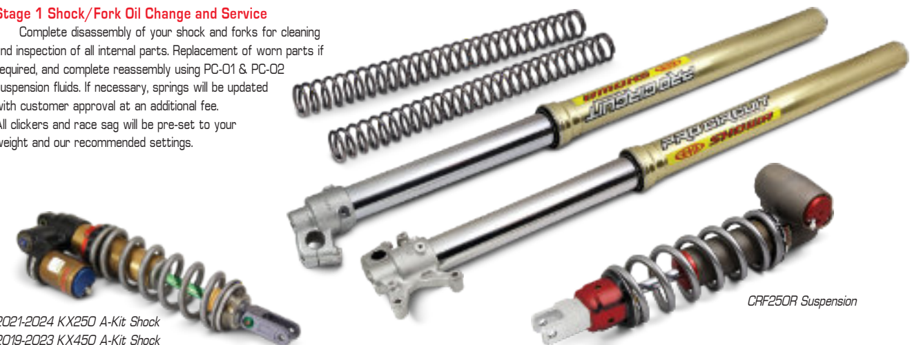
2021-2024 KX250 A-Kit Shock 2019-2023 KX450 A-Kit Shock

Complete disassembly of your shock and forks for cleaning and inspection of all internal parts. Replacement of worn parts if required, and complete reassembly using PC-01 & PC-02 suspension fluids. If necessary, springs will be updated with customer approval at an additional fee. All clickers and race sag will be pre-set to your weight and our recommended settings.