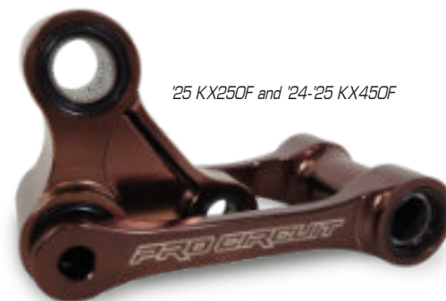
'25 KX250F and '24-'25 KX450F