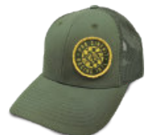
Checkered Globe Snapback