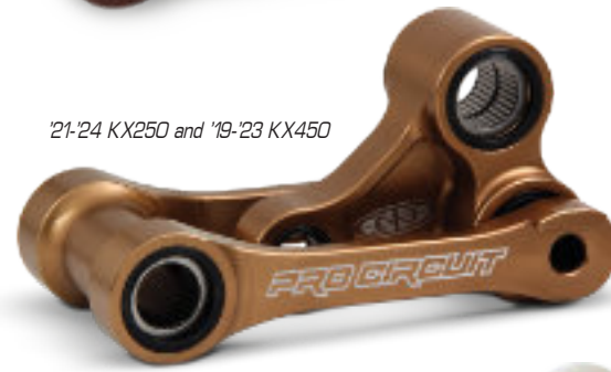
'21-'24 KX250 and '19-'23 KX450