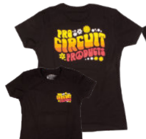
Women's Groovy Tee