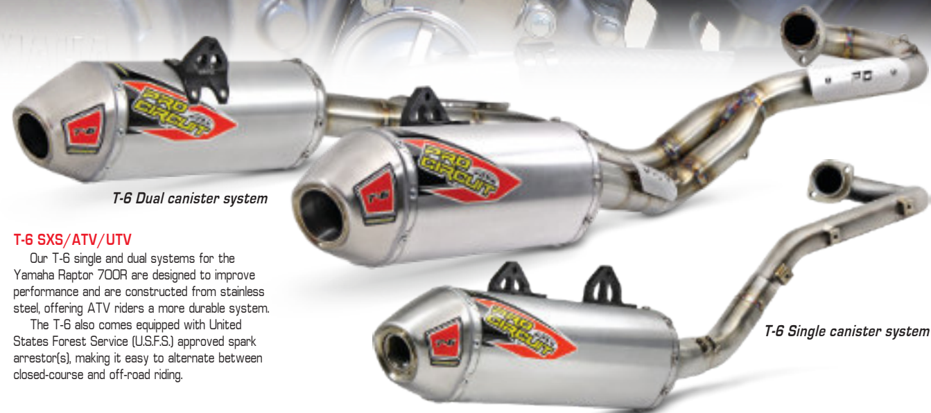
T-6 Dual canister system