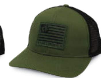
Flag Snapback (olive)