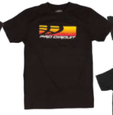
Stripe Box Tee