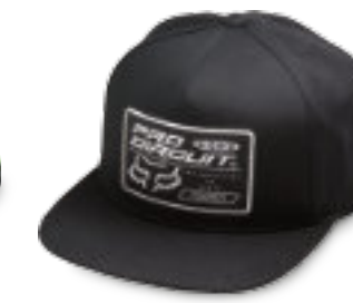
PC Fox Snapback