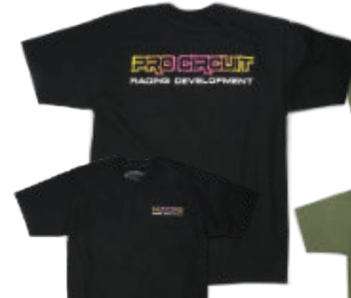
Racing Development Tee