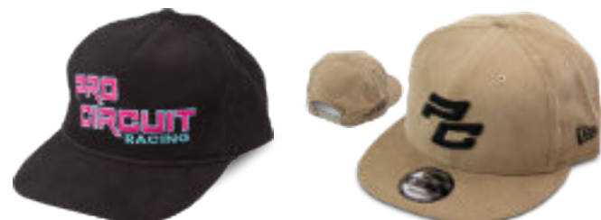
PC Corduroy Black Snapback