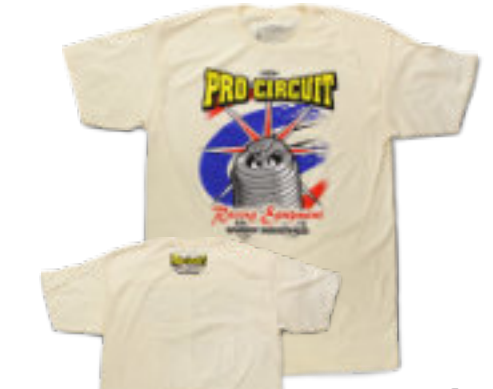
Spark Plug Tee